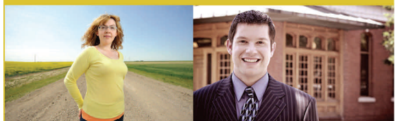
Local Government Authority Certificate

Realize. Local government as big opportunities.