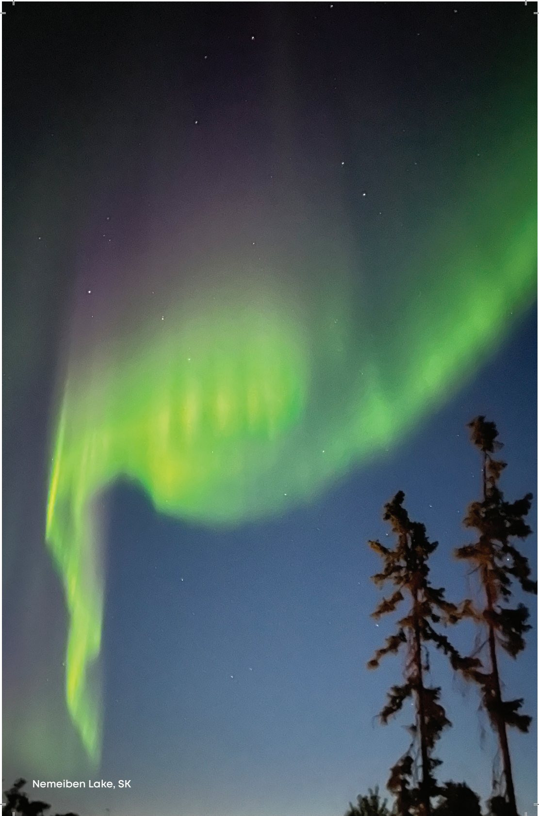
Nemeiben Lake, SK